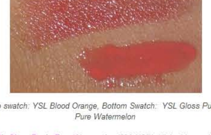
Top swatch: YSL Blood Orange, Bottom Swatch: YSL Gloss Pur in Pure Watermelon

1. YSL Rouge Pure Shine Sheer SPF 15 Lipstick in Blood Orange ($30 USD): When it comes to luxury brands, YSL lippies are at the top of my list. I love the ultra hydrating, smooth texture especially for my sometimes dry lips. The lipsticks have a sheer, glass-like texture but are highly pigmented. They are a bit more slippery than a cream version and are not as long-lasting. But if you don't mind reapplying and prefer a glossy finish, you'll love YSL's Rouge Pure Shine lipsticks. Blood Orange is a gorgeous combination of red and orange with a golden shimmer. This shade is one of my go-to summer hues! The price is a bit steep for a lipstick but the juicy texture, luxurious click cap, beautiful colours and delectable mango scent make this a must-have!