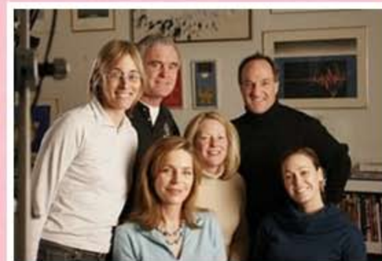
The crew and me with Queen Noor of Jordan